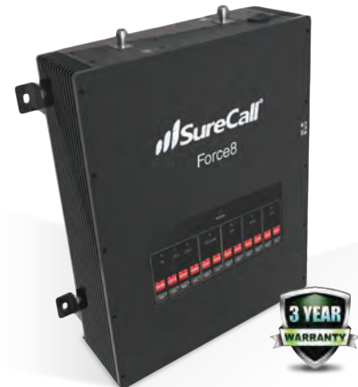
The SureCall Force8 Industrial Amplifier

* Performance and coverage area are dependent upon the strength of cell signal outside of the building and density of structure and materials inside of the building.